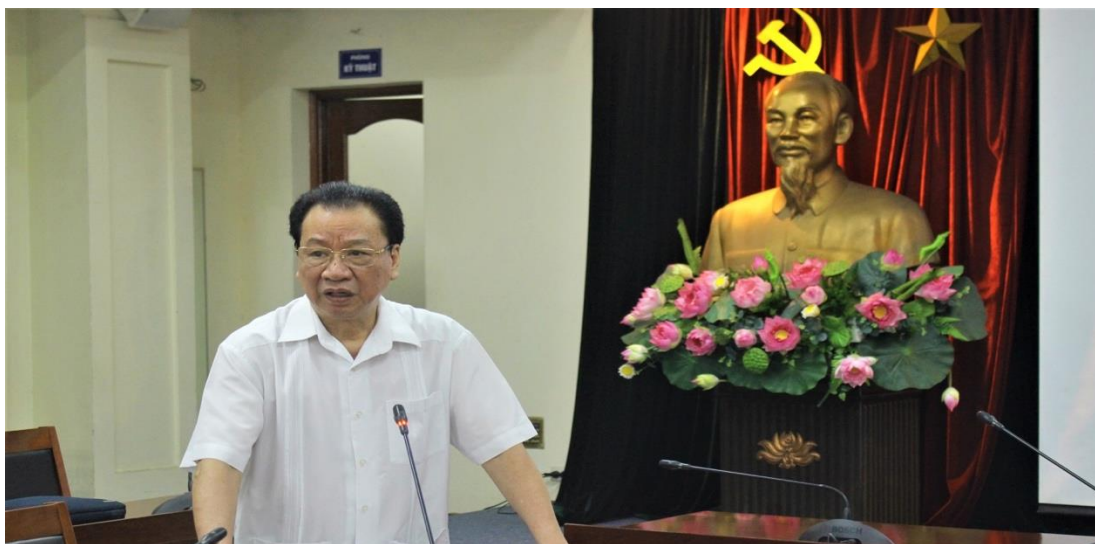
Closing remarks delivered by Mr. Phung Huu Phu, Permanent Vice President of the Central Theoretical Council of the Communist Party of Vietnam, President of the Central Scientific Council of the Communist Party of Vietnam.

Mr. Phung Huu Phu reflected on the discussion, particularly the need for individual responsibility from education and communication officials for following the law. He suggested that the Scientific Council prepare a guidance document on wildlife protection for the Secretariat and the Political Bureau of the Party Central Committee focusing on the urgent need to protect wildlife for the good of humanity. He emphasized that communication campaigns on wildlife protection should be diverse, practical, and consistent.